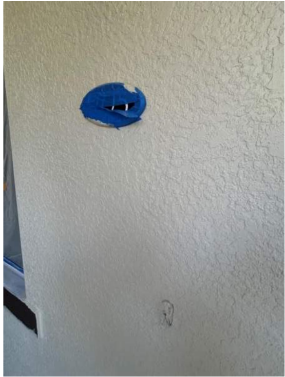
Figure 2: Installation of blue tape was completed around signs and details on the walls to protect from paint application.