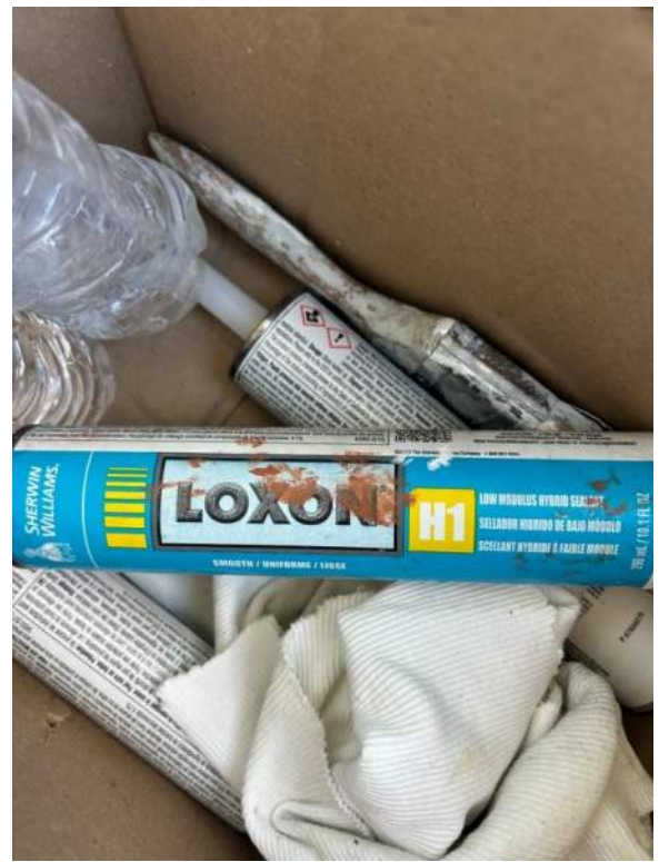
Figure 11: Sherwin Williams Loxon hybrid sealant was observed on site for application.