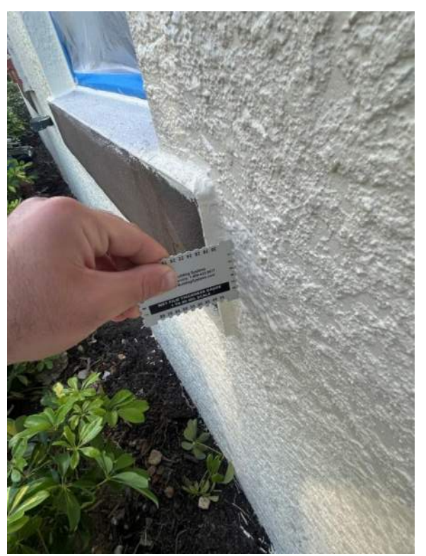
Figure 5: Wet film thickness test was completed for areas of ongoing paint application. Adequate mils was met according to specifications.