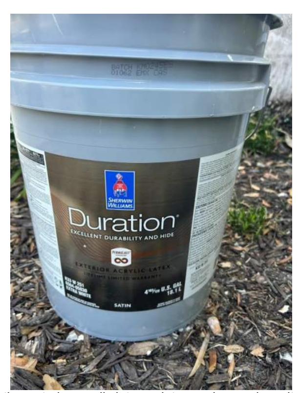
Figure 10: Duration exterior acrylic latex paint was observed on site for application.