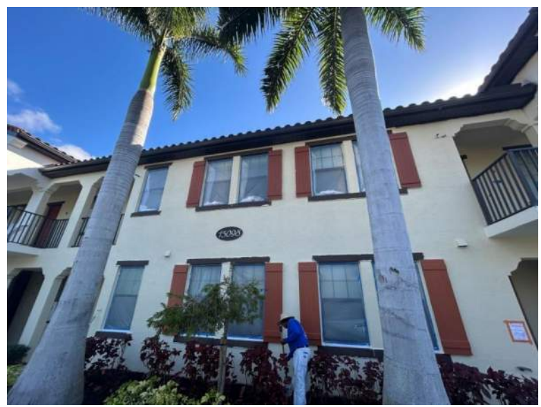
Figure 1: Installation of plastic was completed over all windows to protect from paint application.