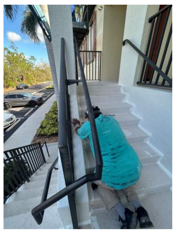
Figure 7: Stucco to stucco sealant application was in progress from the treads/risers to the wall of the south side staircase in front of the building.