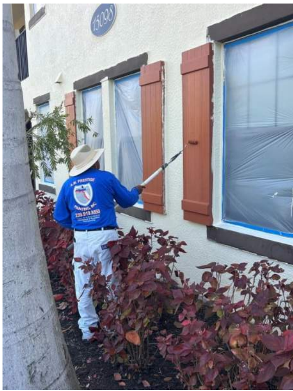
Figure 3: Roller paint application was in progress on the red details on each side of the windows.