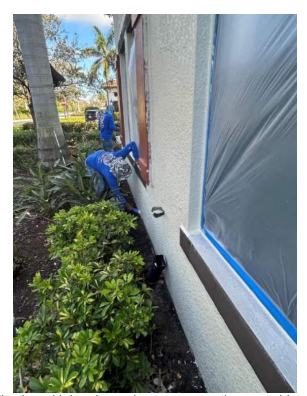
Figure 4: Cut-in paint application with brush was in progress on the west side exterior wall of the building.