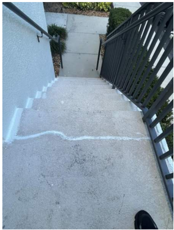
Figure 9: Crack repair was observed on the level 1 stair landings of both staircases in front of the building.