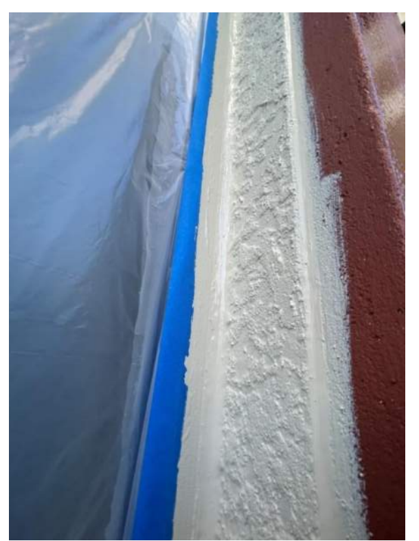
Figure 6: Stucco to metal sealant application was completed on the perimeter of all windows.