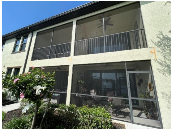
Stack 2 and 3